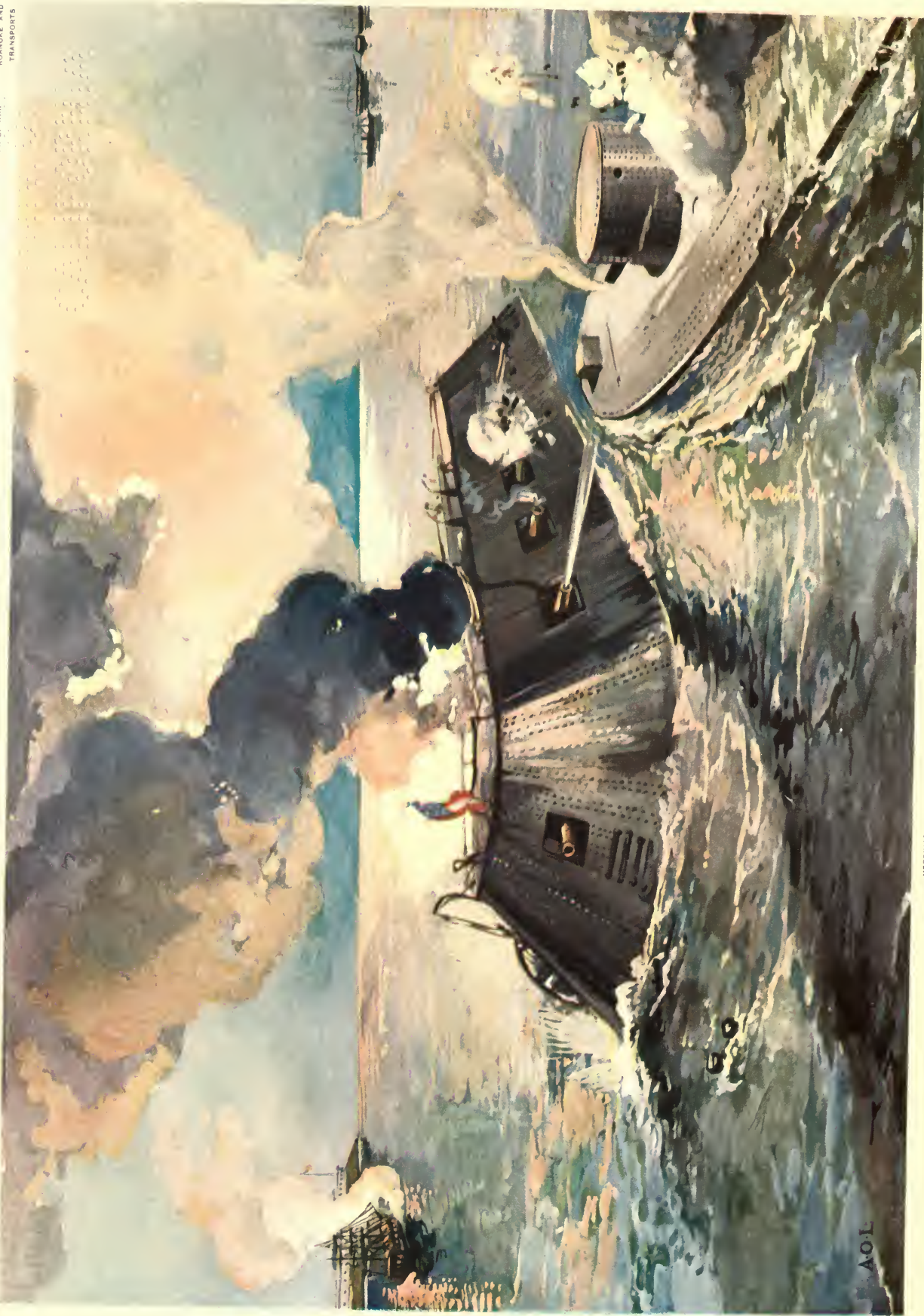
BATTLE BETWEEN THE MONITOR AND MERRIMAC HAMPTON ROADS, MARCH 9, 1862

FRENCH MAN-OF-WAR U. S. PRIGATE ROANKE AND TRANSPORTS