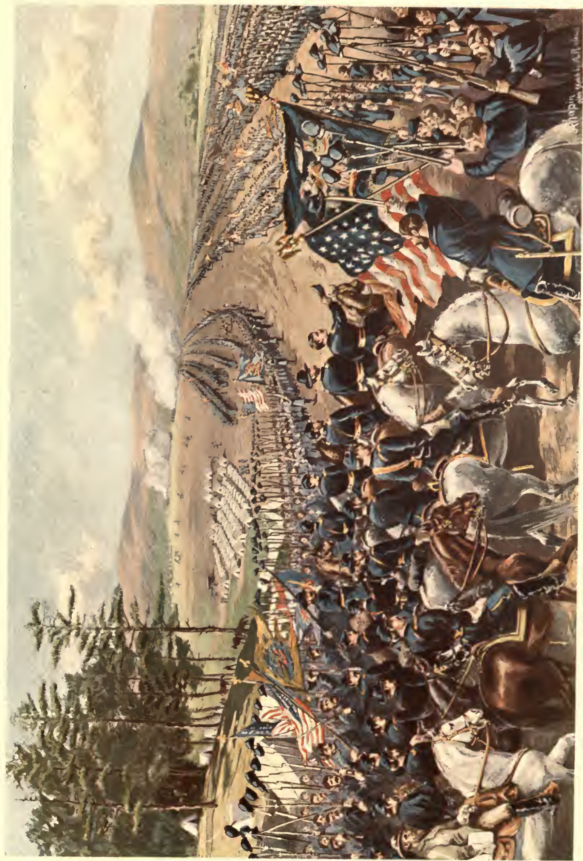
GENERAL GEORGE B. MCCLELLAN TAKING LEAVE OF THE ARMY OF THE POTOMAC, NOV. 10, 1862