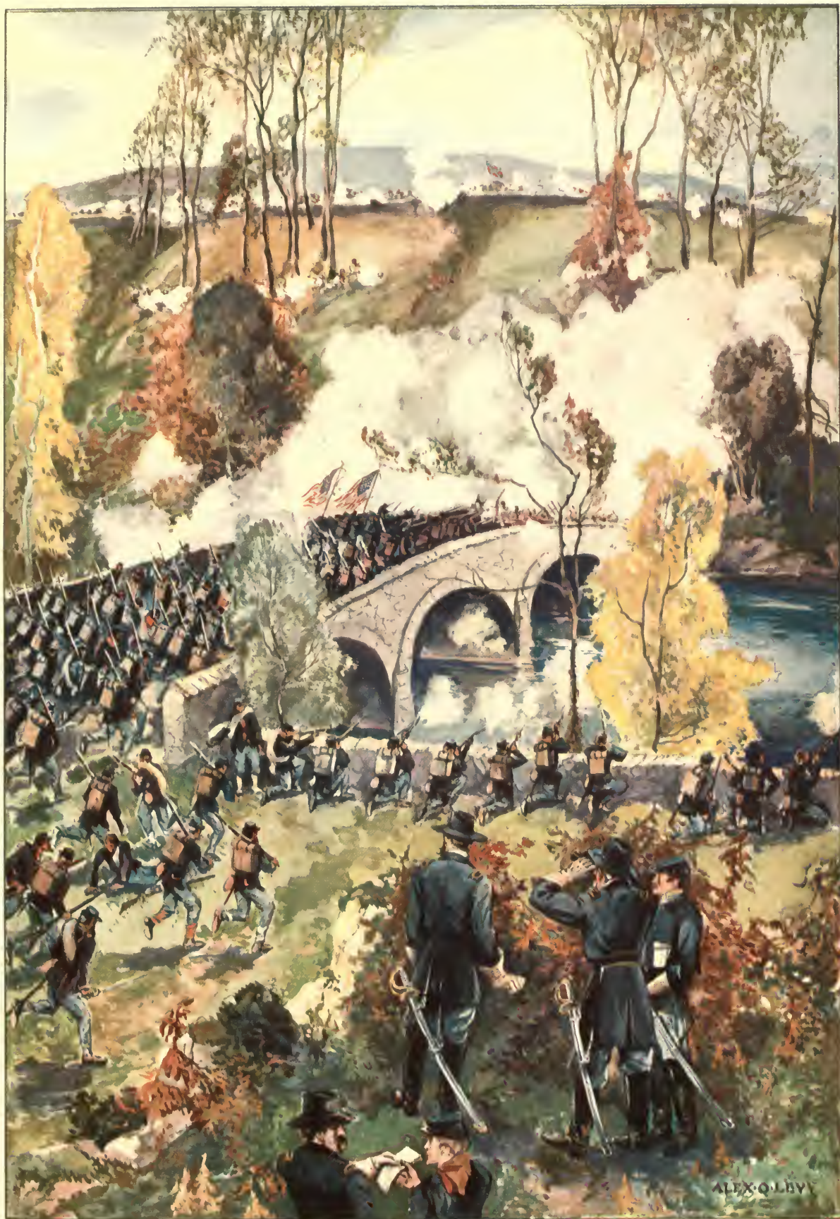
BATTLE OF ANTIETAM